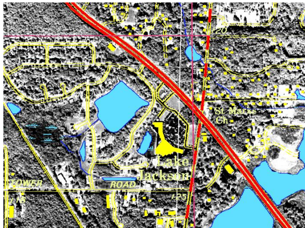
Figure 2: Map revision environment. Old map layers are displayed simultaneously with the latest aerial photos.

The standard work environment for human-based map revision involves simultaneously displaying an old map with the latest aerial photos. The human operator compares them visually and modifies the map whenever a discrepancy is found between the two. Figure 2 displays such an environment, which is the platform of Raster Graph Revision (RGR) system used in United States Geological Survey (USGS).