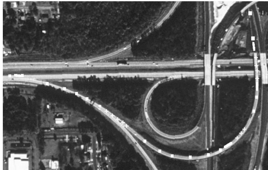
Figure 5: Tracking result. The white crosses are the backtracking results by the computer from the point where it failed and get a new human input.