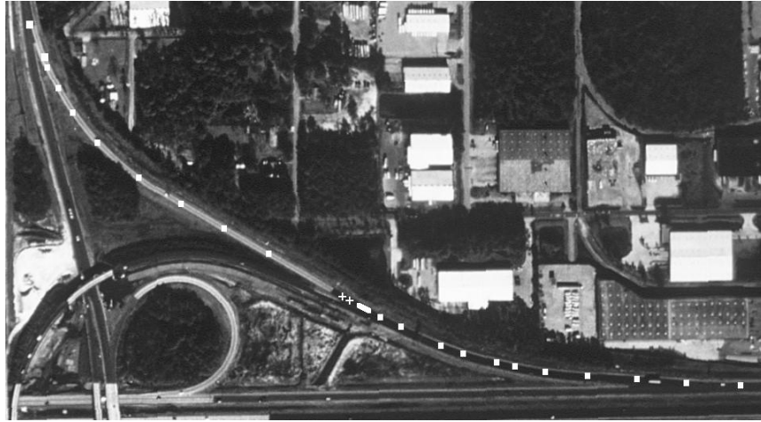
Figure 4: Tracking result. The white dots are the road axis points detected by the tracker. The leftmost two dots are the initial inputs from human. The white line segment in the middle shows the location of the interaction where computer lost control.