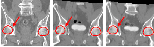
Fig. 1. Registration result on the pelvis with femoral heads contours of the reference image superimposed. On left the reference image, in the middle the floating image after a global affine registration, on right the floating image after using our algorithm.

the images outside the regions used in the registration remains consistent from an anatomical point of view.