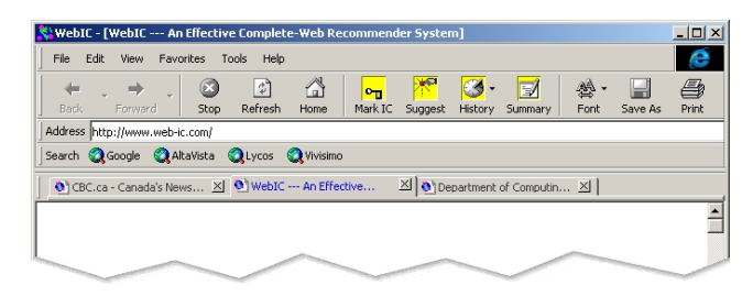
Fig. 1. WebIC — An Effective Complete-Web Recommender System

We developed a system, WebIC (Figure 1) that observes the user as she browses the Web, and in particular, records 35 different "browsing properties" of the words that appeared on these visited pages (e.g., for each word w, did the user tend to follow links anchored with w, or did the user "back out of" pages whose title included w, etc. [8]). WebIC then applies a trained classifer to these browsing properties, to identify which of these encountered words is "relevant" to the user's current information need; it then attempts to find pages that address these needs.