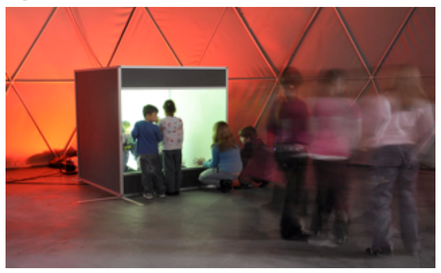
Figure 2. Participants and performers are observed by onlooking bystanders

During the course of a performance, individuals may transition between or even simultaneously fulfill these roles. There is a mutual relationship between taking an action, and observing the actions of others, hence even a performer shares a similarity to a spectator.