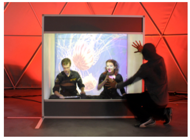
Figure 1. humanaquarium.

{g.p.schofield, john.shearer, jayne.wallace, p.l.olivier} @ ncl.ac.uk