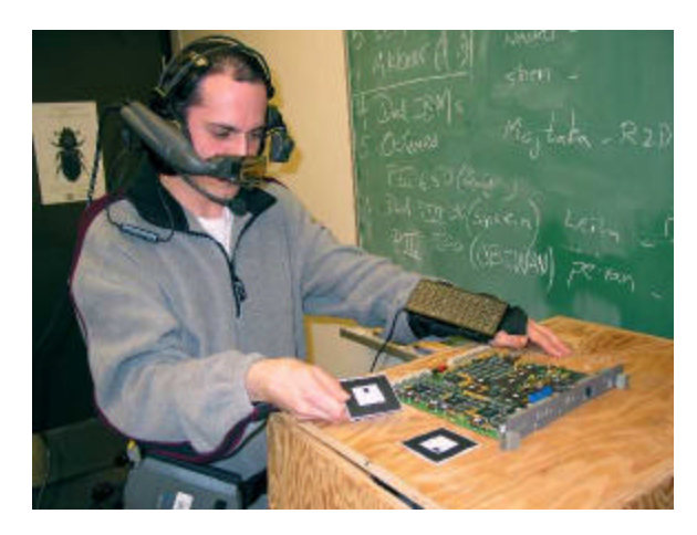
Figure 1. A trainee works with a wearable computer

Imagine a trainer and some trainees are in different locations. The trainees are trained to install a chip on a switch board. As shown in figure 1, a trainee wearing a wearable computer is going to work with a physical switch board on the table. Let's refer to him/her as the local trainee A. A trainer T and a remote trainee B who are in different locations are working on the remote workstations, watching A's action through the shared view of the local trainee. All of them are equipped with a microphone and are able to talk through live audio.