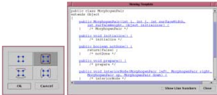
(a) Boundary conditions for the Mesh.